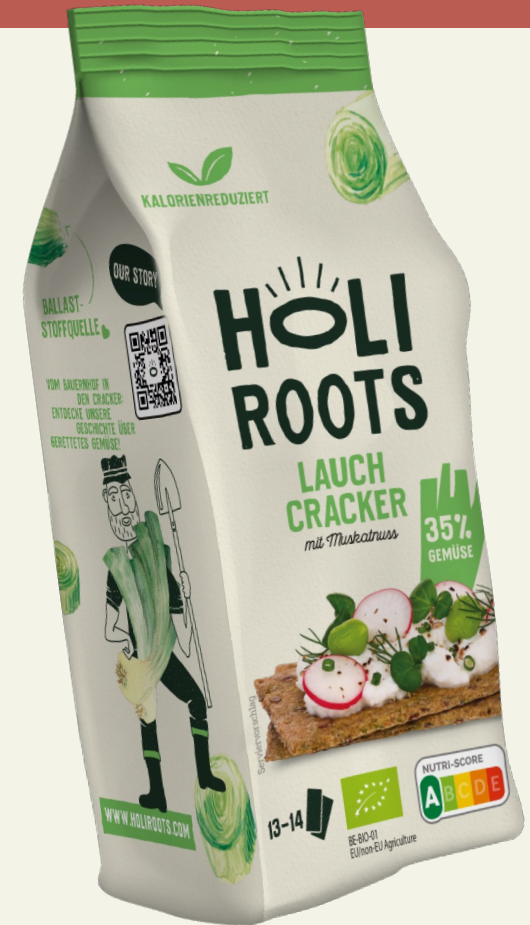
LEEK & NUTMEG