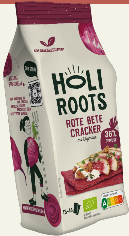
BEETROOT & THYME