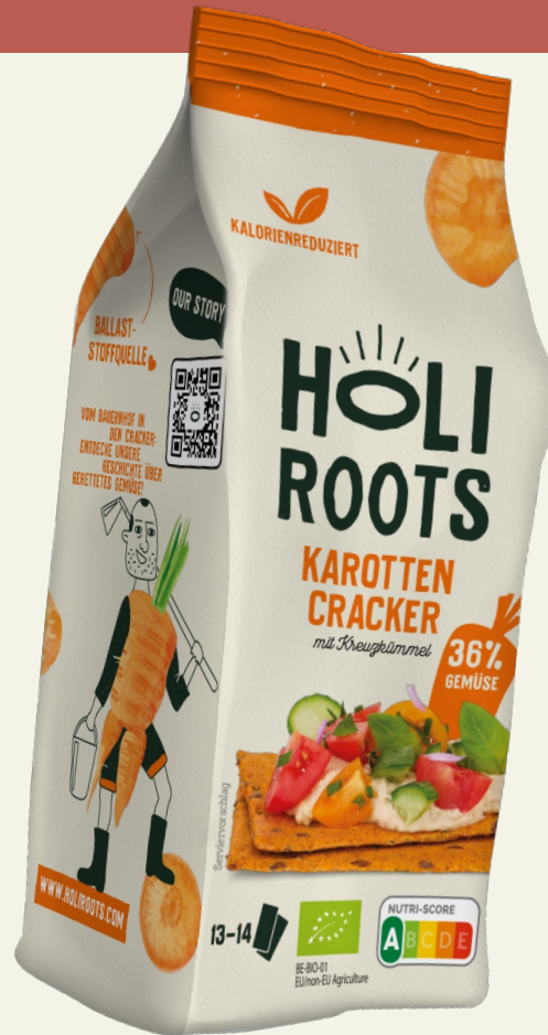
CARROT & CUMIN