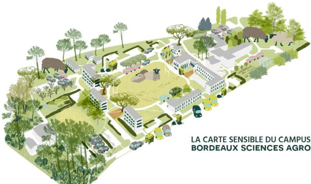
LA CARTE SENSIBLE DU CAMPUS BORDEAUX SCIENCES AGRO